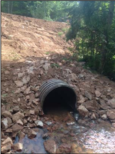
Wildcat Road Culvert Replacement

Events Offered: 8 Events Attended: 12 Culverts Replaced: 3 Stream Miles Opened: 3