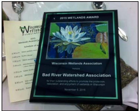
Wetland Award Recipient Wisconsin Wetlands Association