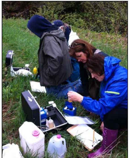
Water Chemistry Monitoring