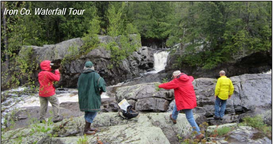
Iron Co. Waterfall Tour