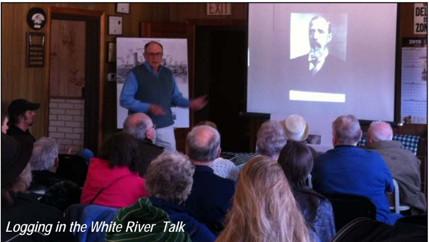
Logging in the White River Talk