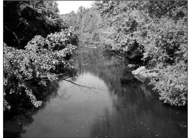
The beautiful Bad River