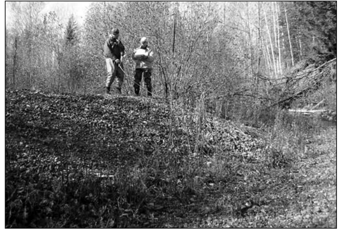
Volunteers Cordell Manz and Jim Emerson measure a depositional bar on the October 24 field day.

To date volunteers have identified and documented nearly 50 eroding banks, 85 bars, and 26 beaver dams and/or log jams that are affecting stream flow. This data has been mapped out and we're beginning to prioritize the most important areas that are in need of restoration to improve fish habitat and the health of the river.