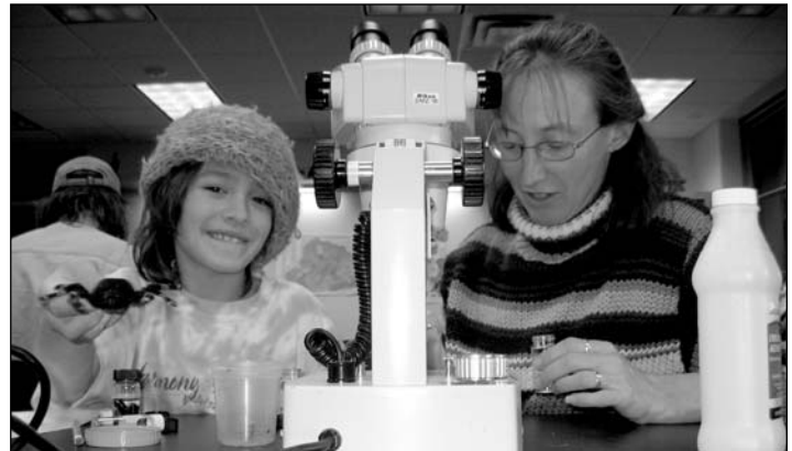
The health of our watershed comes down to what's in the water. Look inside to learn more about our water quality monitoring efforts.